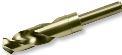
Style 190C Straw Finish