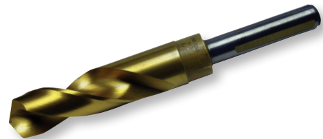
Style 190C-TN TiN-coated